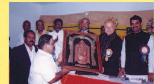
Felicitating Shri Sushil Kumar Shinde, Former Governor, Andhra Pradesh on the eve of Inauguration of the college Building.