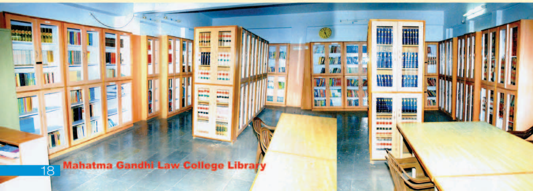
18 Mahatma Gandhi Law College Library

Justice V R Krishna Iyer, Supreme Court of India.