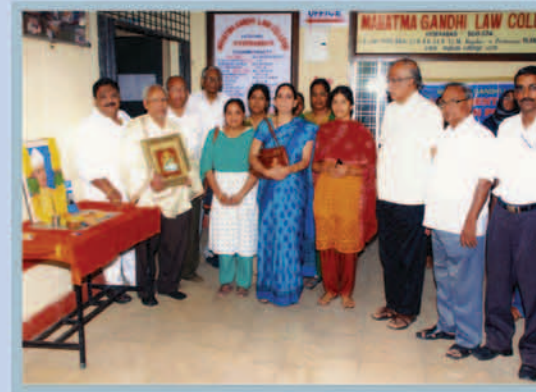
Celebration of the "Teachers' Day" in the college