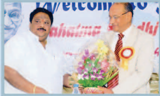
Felicitation to Hon'ble Justice Chandra Kumar, Judge, High Court of Andhra Pradesh, on his visit to the College on the occasion of 'College Day'.