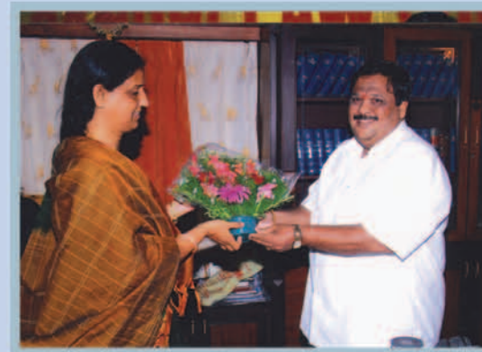
Presentation of Bouquet to Smt. Sabitha Indra Reddy, Hon'ble Home Minister of Andhra Pradesh on her visit to the college