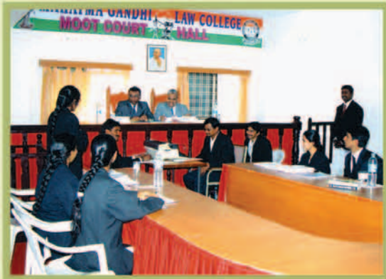
Hon'ble Justice Shri P. Swaroopa Reddy, Judge A.P. High Court & Hon'ble Justice Shri C.V. Ramulu, Judge A.P. High Court acting as the Judges in the final of Twin Cities Law colleges Moot Court Competition March 2008 in this college.