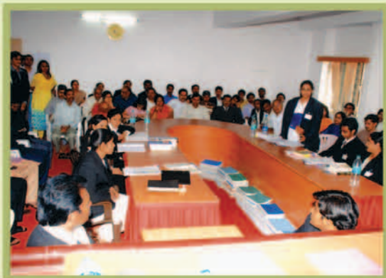
Students participating in the A.P. State Level Moot Court competition, February 2009 in this college.