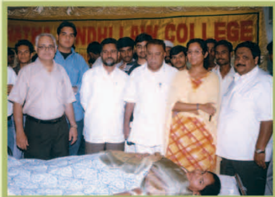
Blood Donation camp by the students of this college in the presence of Shri Shaik Hussain, MLC, Andhra Pradesh Legislative Council.